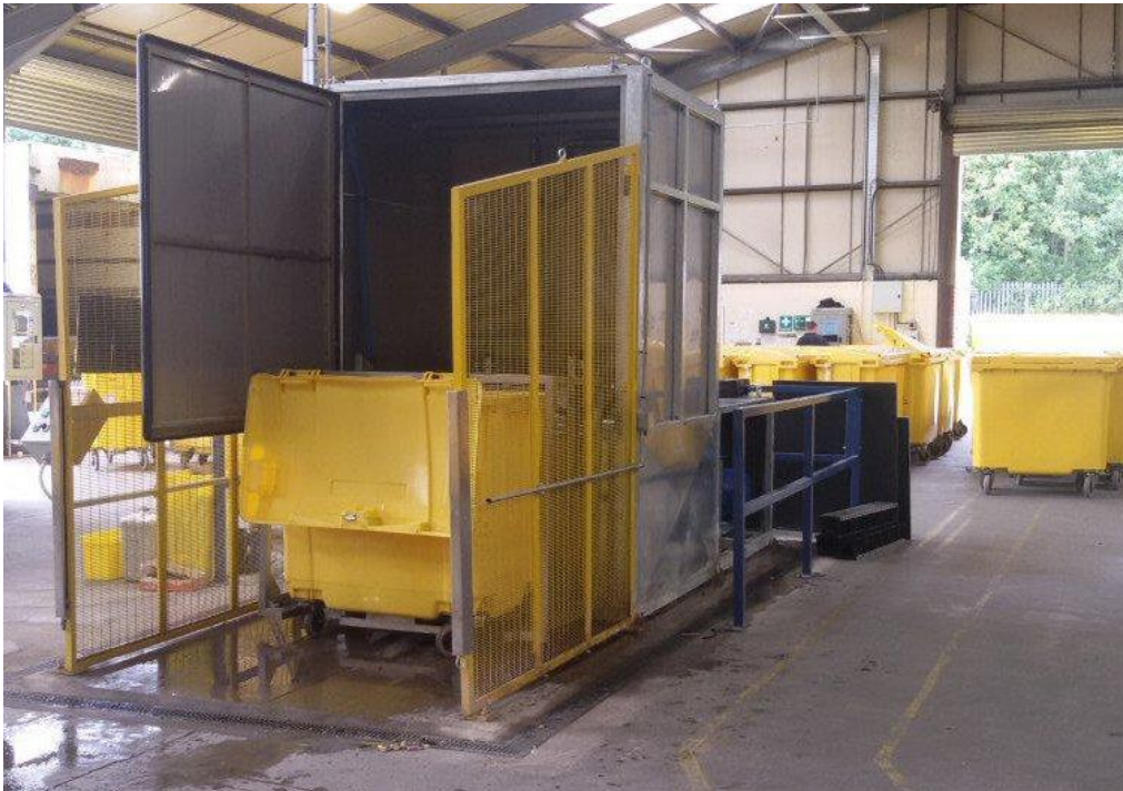
(Example picture only)