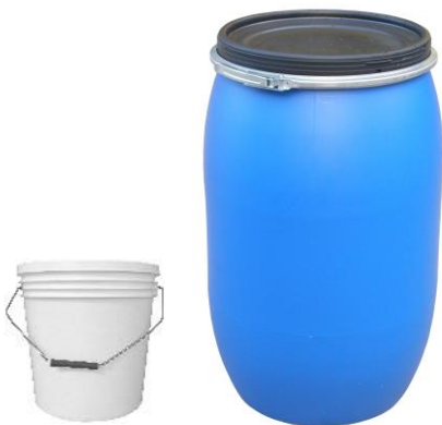
Plastic barrels, bins and pails