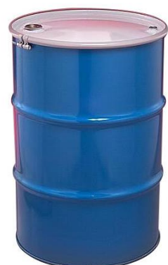
Metallic barrels, bins and drums (open top and with cap)